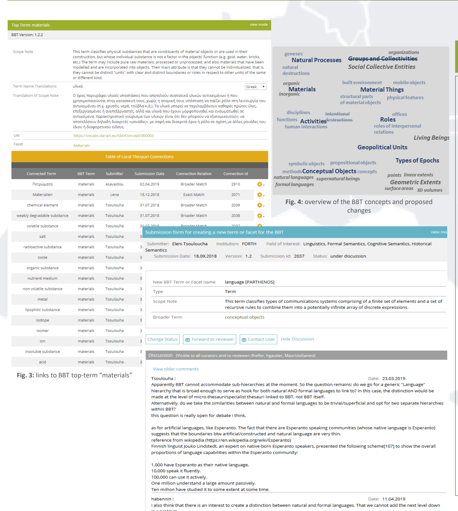
Fig.5: discussing a proposed change